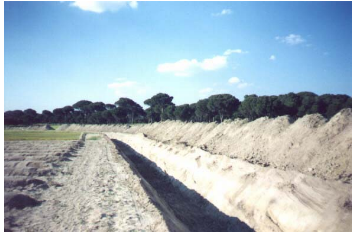
Figure 3. Initial building works of artificial recharge ditches at Santiuste basin, Segovia, Spain.