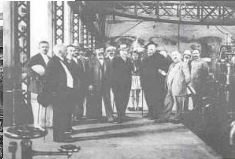
169. Ο Ε. Βενιζέλος στο τμήμα παραγωγής ηλεκτρισμού της C.F.M.L. (1911).

The company introduced main technological advancements in Greece